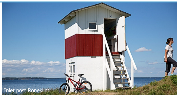
Inlet post Roneklint

Roads: Gravel roads, forest roads and asphalted country roads with moderate traffic. Max 2 % gradient. Cycletime 11 kmh (adults) app. 3 hours Cycletime 8 kmh (kids) app. 4 hours and 15 minutes