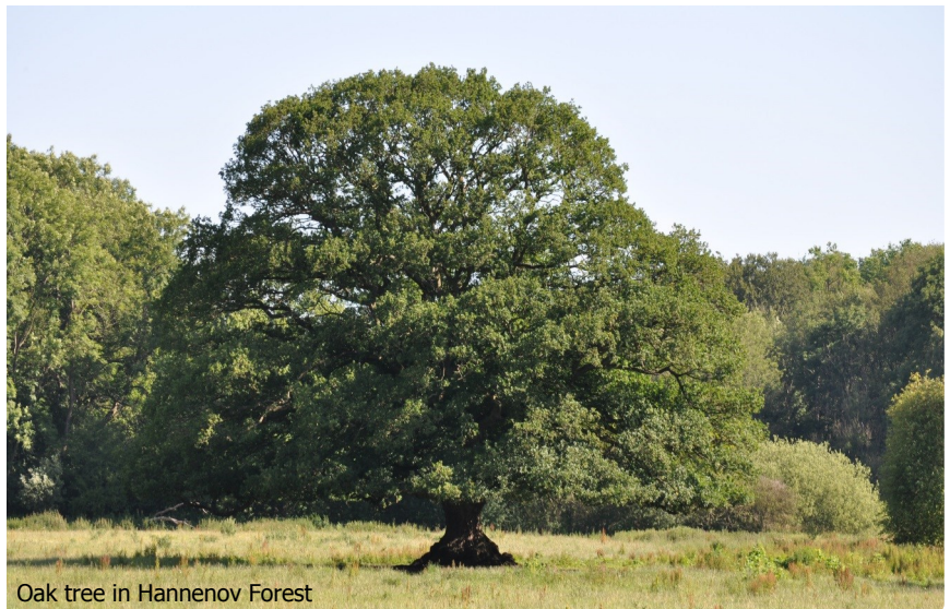
Oak tree in Hannenov Forest

Daily train connections between Nykøbing Falster and Copenhagen. Cycles can be carried on regional trains www.rejseplanen.dk