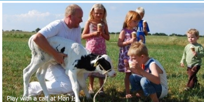
Play with a calf at Møn Is