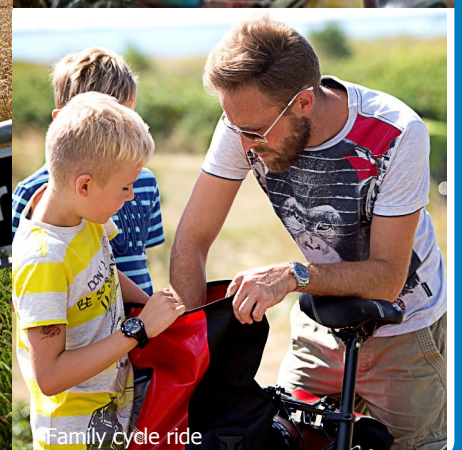
Family cycle ride