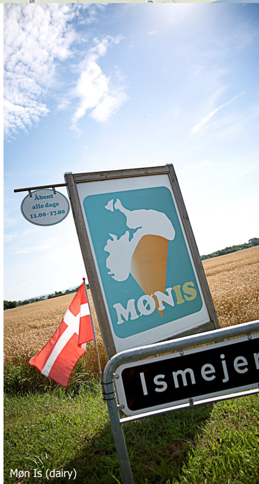
Møn Is (dairy)

Roads: paved main roads with only light traffic. Max. 2% slopes. Effective cycling time at 11 km/h (adults) approx. 2 hours. Effective cycling time at 8 km/h (children) approx. 2:40 hours