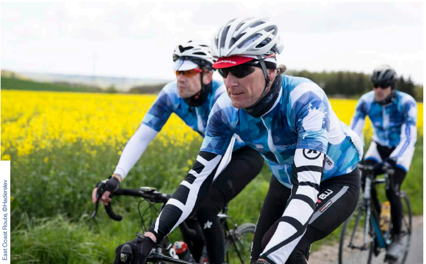
East Coast Route, ©Haderslev

T he third stage of the Grand Départ of the Tour de France 2022 starts July 3 rd in Vejle. Approximately 90 km of the 182.2 km long stage runs through the eastern part of Sønderjylland, passing the market towns of Haderslev and Aabenraa on its way to the finish in Sønderborg.