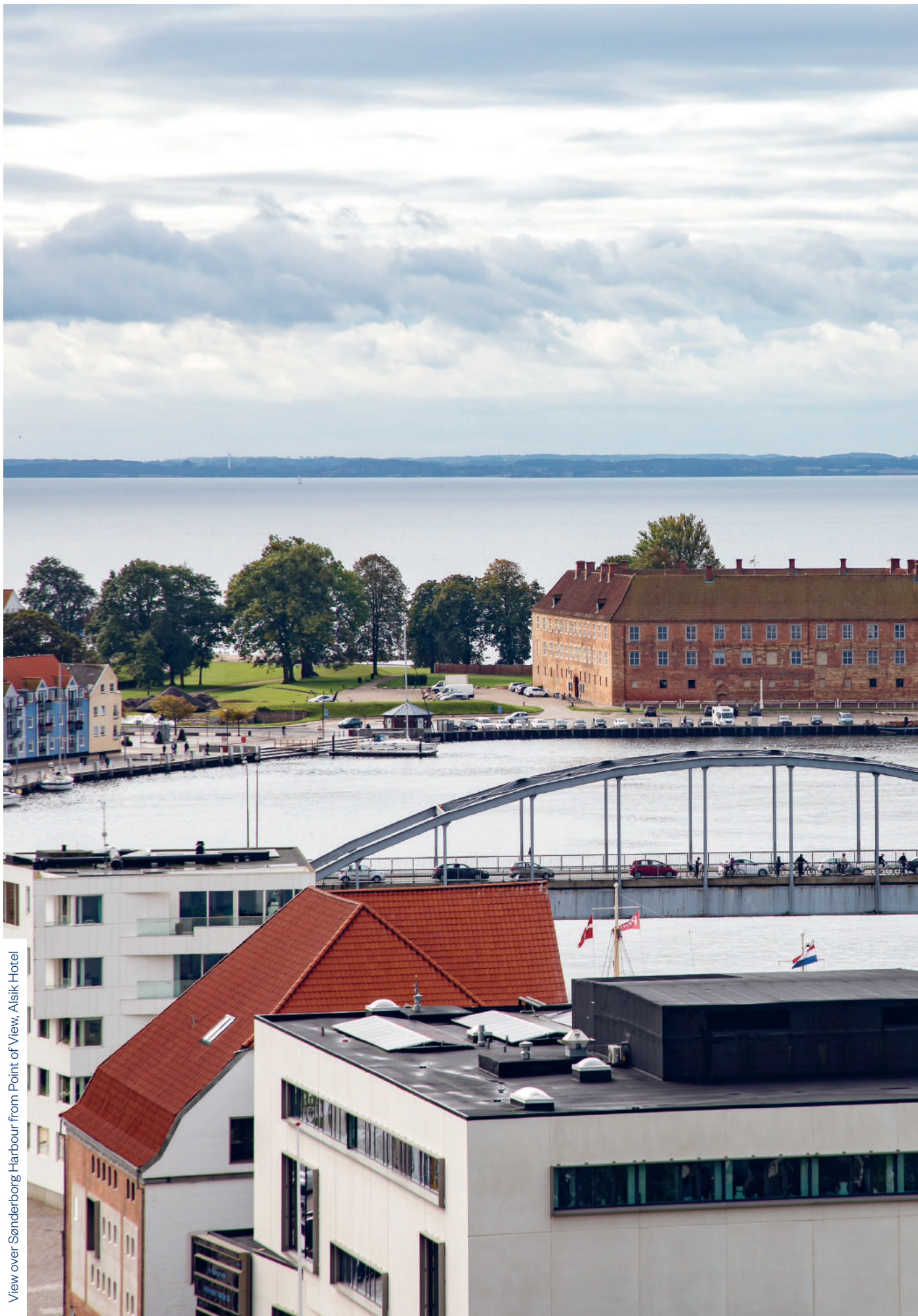
View over Sønderborg Harbour from Point of View, Alsik Hotel