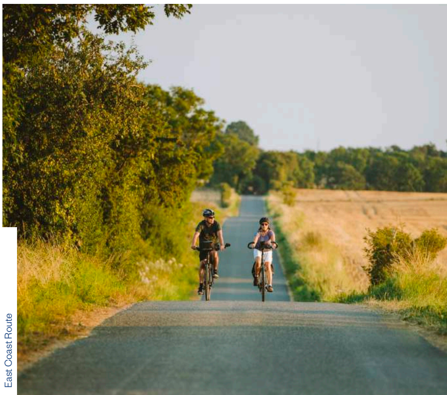
East Coast Route

T he Danish region Sønderjylland is situated in the southern part of the Jutland Peninsula.