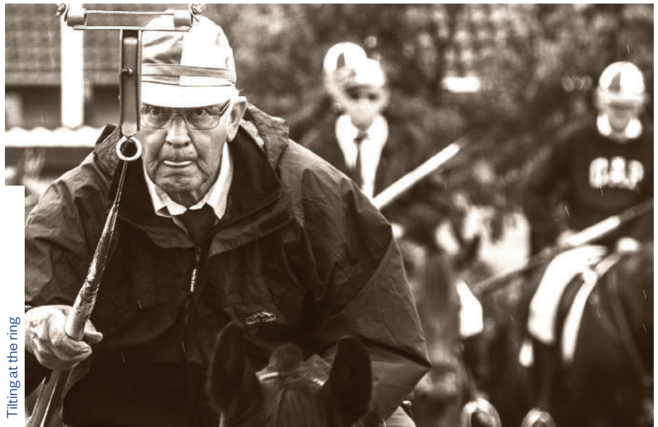
Tilting at the ring

Picking oysters directly from the mudflats. At low tide, the mudflats of the Wadden Sea lie dry, and an abundance of oysters meet your eye. Oysters can be picked and eaten as long as the sea water is cold. Best experience is always with a guide who knows all about the tide, oysters and where to find the best ones.