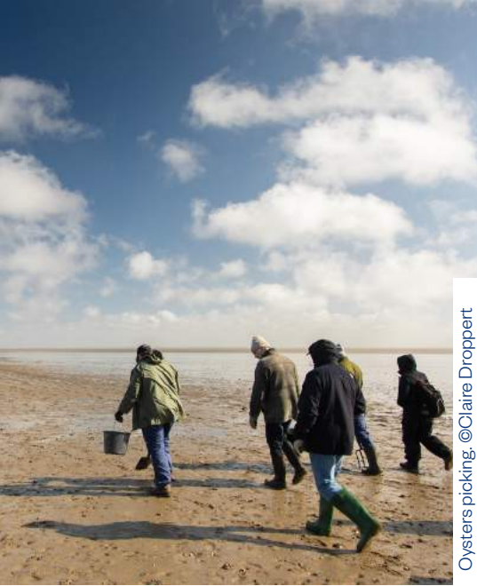
Oysters picking.