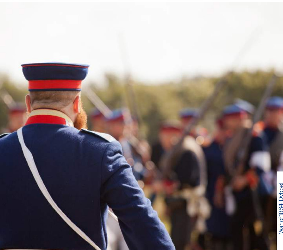
War of 1864, Dybbøl

After WW I, inhabitants of the former duchies were allowed to vote whether they wanted to be part of Denmark or Germany, and the path of the border was decided on the hand of the outcome of the referendum. In 1920 the northern part of the duchy once again became part of Denmark.