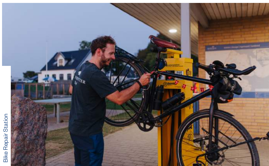
Bike Repair Station

A guidebook for the entire route will be published during 2021, and ten new cycle routes have